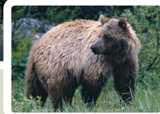
Grizzly Bear