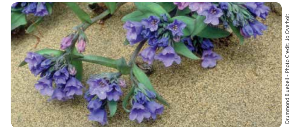
Drummond Bluebell

All Species at Risk Committee documents, including species status reports and assessments, are available on the NWT Species at Risk website: www.nwt-speciesatrisk.ca