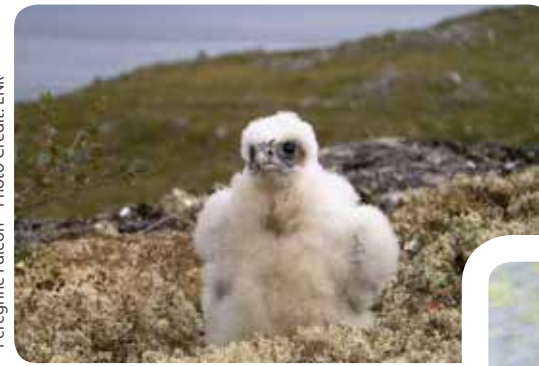
Peregrine Falcon - Photo Credit: ENR

The Species at Risk (NWT) Act (the Act) provides a process to identify, protect and recover species at risk in the Northwest Territories (NWT). The Act applies to any wild animal, plant or other species managed by the Government of the Northwest Territories. It applies in most areas of the NWT, on both public and private lands, including private lands owned under a land claims agreement.