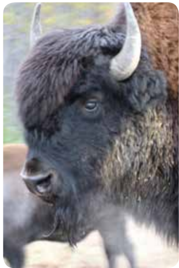
Wood Bison