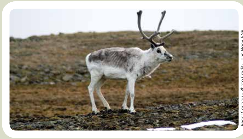
Peary Caribou