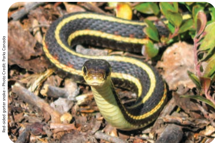
Red-sided garter snake

The Species at Risk (NWT) Act (the Act) provides a process to identify, protect, and recover species at risk in the Northwest Territories (NWT). The Act applies to any wild animal, plant, or other species managed by the Government of the Northwest Territories. It applies in most areas of the NWT, on both public and private lands, including private lands owned under a land claims agreement.