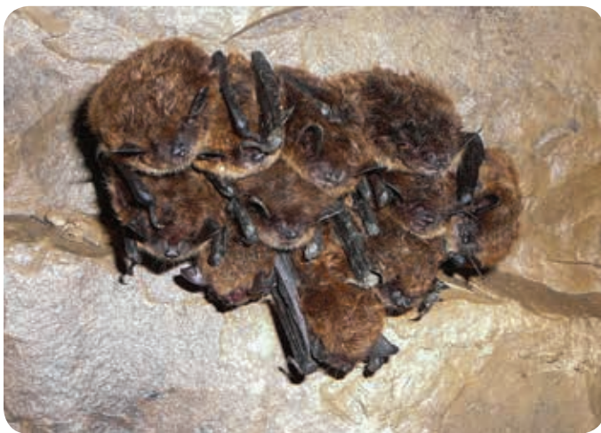
Little brown myotis

The Assessment Schedule is subject to annual review and modification.