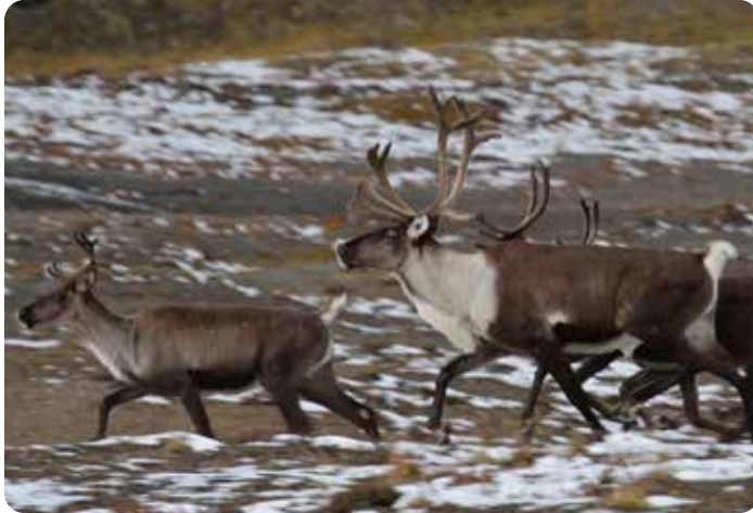
Northern mountain caribou

Under subsection 16(1) of the Species at Risk (NWT) Act , the Conference of Management Authorities (the Conference) must submit an annual report to the Minister of Environment and Climate Change by September 30 each year. This annual report covers the fiscal year ending March 31, 2023.