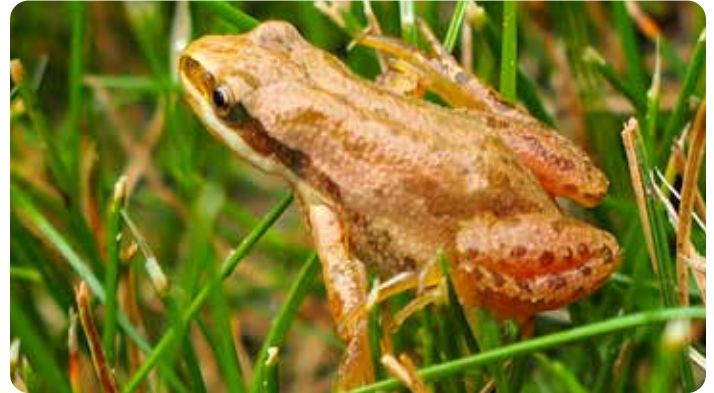
Boreal chorus frog at Fort Simpson

The Species at Risk (NWT) Act provides a process to identify, protect and recover species at risk in the Northwest Territories (NWT). The Act applies to any wild animal, plant, or other species that is managed by the Government of the Northwest Territories. It applies in most areas of the NWT, on both public and private lands, including private lands owned under a land claim agreement.