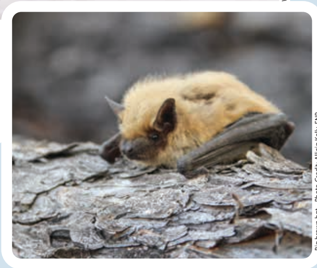
Big brown bat