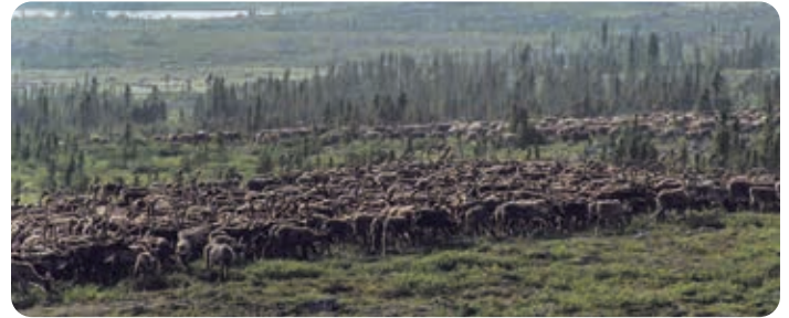
Barren-ground caribou – Photo Credit: Anne Gunn

The Species at Risk (NWT) Act provides a process to identify, protect, and recover species at risk in the Northwest Territories (NWT). The Act applies to any wild animal, plant, or other species that is managed by the Government of the Northwest Territories. It applies in most areas of the NWT, on both public and private lands, including private lands owned under a land claim agreement.