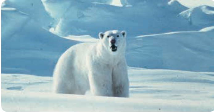
Polar bear

Under subsection 16(1) of the Species at Risk (NWT) Act , the Conference of Management Authorities (the Conference) must submit an annual report to the Minister of Environment and Natural Resources by September 30 each year. This annual report covers the fiscal year ending March 31, 2020.