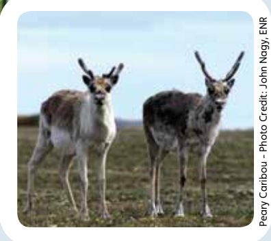
Peary Caribou