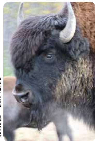
Wood Bison