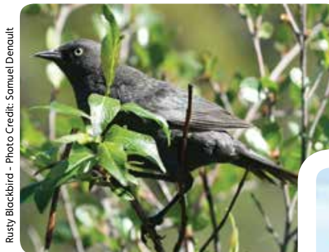
Rusty Blackbird

Details on Conference activities are available on the NWT Species at Risk website: www.nwt-speciesatrisk.ca