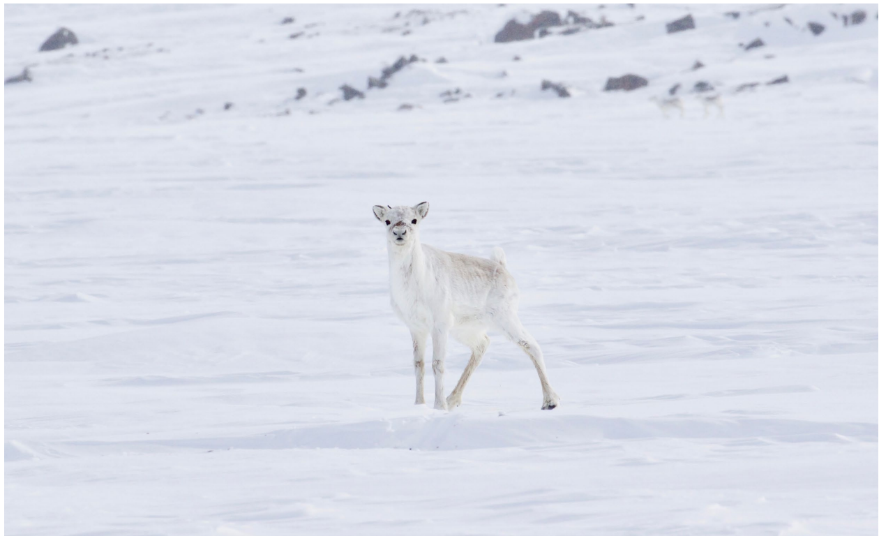
Figure 2. Dolphin and Union caribou in the Wentzel River area, Nunavut.

In the NWT, Dolphin and Union caribou were reassessed by the Species at Risk Committee (SARC) in April 2023. SARC assessed Dolphin and Union caribou as an Endangered species (previously Special Concern), owing to the species' low numbers, its sensitivity to multiple impacts of climate change and a high level of community concern.