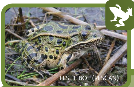
Many amphibian populations, like this Northern Leopard Frog, are in decline across North America.

Between 1995 and 2003, governments in Canada signed the National Accord for the Protection of Species at Risk agreeing to establish legislation and programs to provide effective protection of species at risk throughout Canada. The Species at Risk (NWT) Act is complementary to the federal Species at Risk Act and addresses concerns at the territorial level.