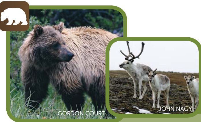
Grizzly bear (left photo) numbers are sensitive to declines because they don't have cubs until they are 6-8 years old, and have small litters only every 3-5 years.

The Conference of Management Authorities will develop consensus agreements on listing species at risk, conservation measures, management plans and recovery strategies. As part of reaching consensus, each co-management board carries out the consultation and processes required under their land claim agreement. The GNWT is responsible for Aboriginal consultation in areas without a settled land claim and for consultation with all stakeholders such as industry, outfitters, resident hunters, environmental groups, and the public.