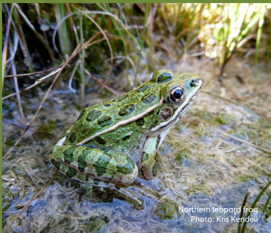
Northern leopard frog

To emphasize actions aimed directly at recovery, projects will be granted funding according to a tiered priority system (see tables). Priorities have been established based on how projects link to recovery strategies or management plans, species focus, and the main purpose or objective of the project.