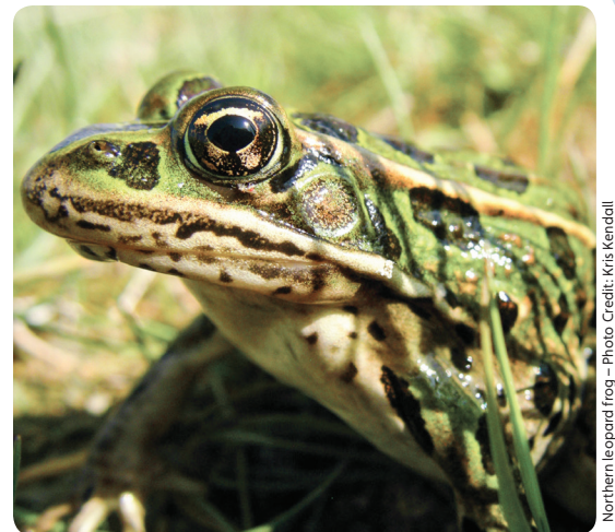
Northern leopard frog – Photo Credit: Kris Kendall